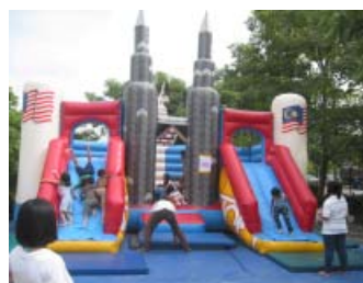
One of the inflatable games

Lucky draw prizes were given out during the event. The participants enjoyed their time with the games, food, and accessories sold during the event. Adults and children too were having fun with the inflatable games in the school. The Rocky Mountain inflatable was the most popular among the participants.