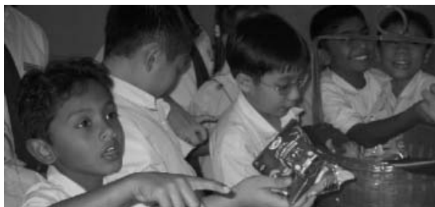
Eager to buy the food...