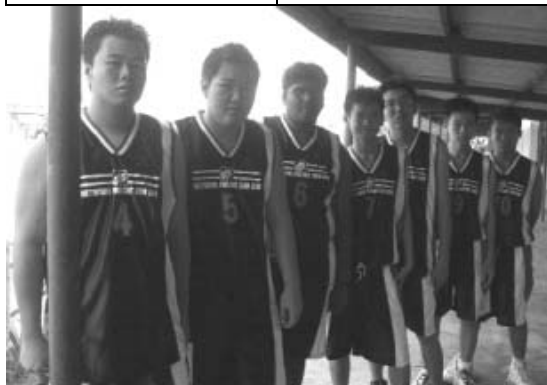
The Under 18 basketball team