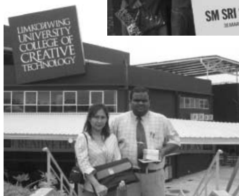
The advisors of the Editorial Board...