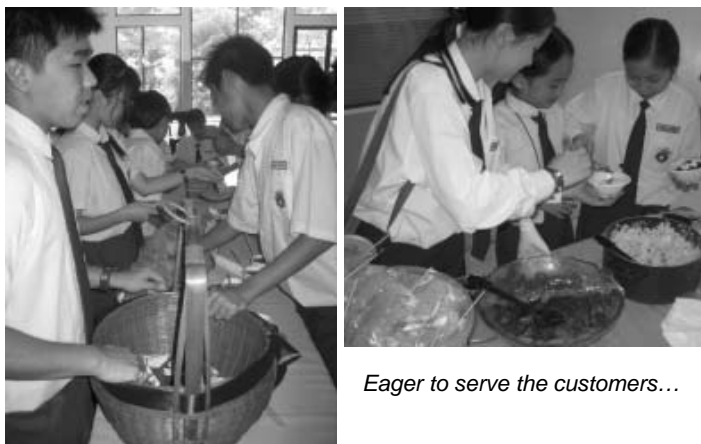
Eager to serve the customers...

The Young Entrepreneurs' Club and Builders' Club of Sekolah Sri Sedaya organised a Food Fair on the 19 & 20 April 2004. On behalf of the Kiwanis Foundation, we would like to express our gratitude to the parents for their contribution, donations of food and help in making this food fair a success. RM4,199.00 was collected during the two days. We thank the parents and students for making this event a success. The proceeds from the Food Fair will be used to benefit the children of the Kiwanis Down Syndrome Petaling Jaya Centre.