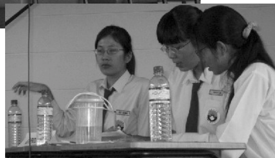
The opposition team...