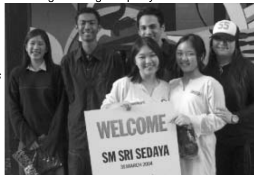
The warm welcome given to us

The Editorial Board of Sekolah Sri Sedaya visited Limkokwing University College on 31 March 2004 for a workshop on producing a school magazine. The Editorial Board consists of 6 teachers and 24 students. They were given a tour around the campus and briefed about the university college. The Editorial Board members were taught by the Limkokwing teachers and students on how to produce a school magazine of good quality.