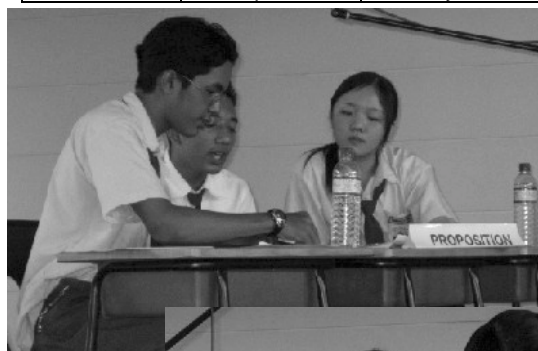
The proposition team...