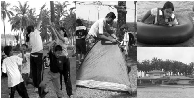
Campers will be setting up their own tents to sleep in

Sekolah Sri Sedaya in collaboration with University College Sedaya International (UCSI) will be organising Xplore Camp, an Adventure-Based Learning camp for the Primary 6 and Secondary students . The camp will be held at Putrajaya Taman Wetland. Xplore Camp will be a unique life-changing experience developed with a blend of challenging outdoor, water-based activities and life skills.