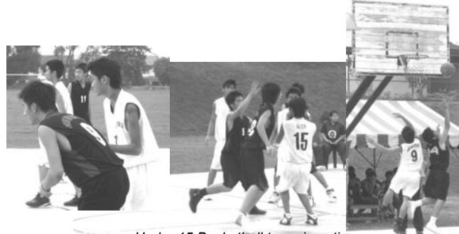
Under 15 Basketball team in action