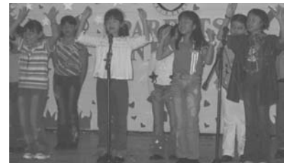
PRIZE GIVING DAY

The 2005 Prize Giving Ceremony was held on 25 April to honour the high achievers in the school and national examinations, UPSR, PMR & SPM for the year 2004. Students who had performed well throughout the year were presented with certificates for their achievement. Parents also came to give their support to their children. Parents, teachers, students and prize recipients were entertained by songs, sketches and hip hop dances by the Secondary students. After the performances, parents, teachers and prize recipients were entertained to lunch. We thank you parents for making the time to support the school and your children.