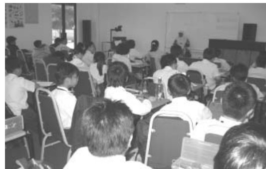
Workshop for students preparing for their UPSR.

The Form Five Trial Examination will start on 16 September, while the Primary and Secondary non-examination classes will be sitting for their examination in early October.